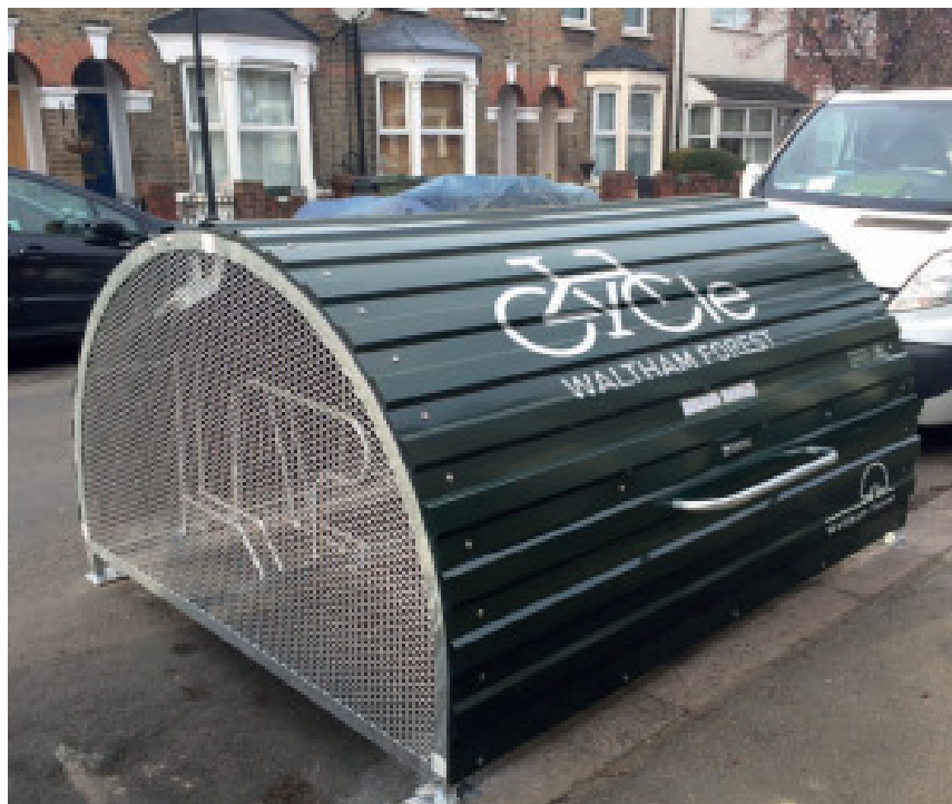
Figure 2: Secure storage bike boxes