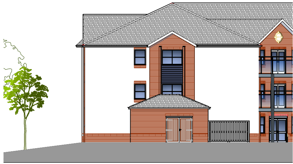
SOUTH EAST ELEVATION showing sprinkler tank building